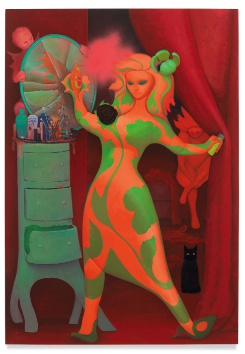
Left: Inka Essenhigh, Mission Chinese Restaurant, 2020, Enamel on canvas, 40 x 50 inches, 101.6 x 127 cm; Right: Inka Essenhigh, Forever Young, 2020, Enamel on canvas, 60 x 42 inches, 152.4 x 106.7 cm; Courtesy of the artist and Miles McEnery Gallery, New York, NY